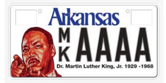
Image belongs to the Arkansas Department of Finance and Administration

Members of DFA-U expressed gratitude for the information that was presented from all divisions of DFA so far. Some noted that they have been with the Department for many years and never knew the inner operations of other divisions within the department.