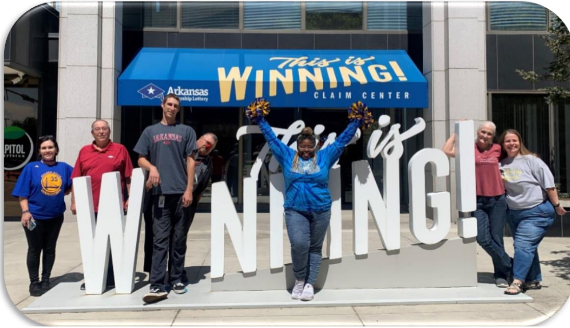
Little Rock Team