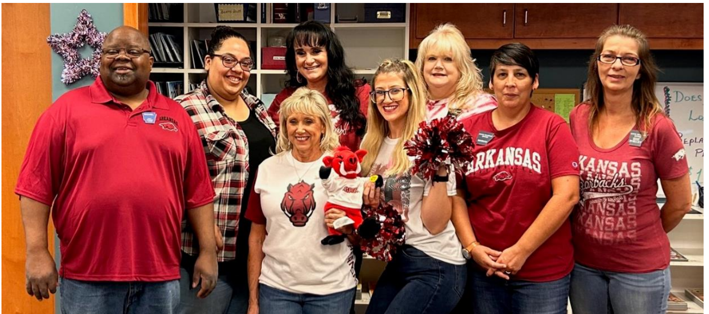
Ft. Smith East Team