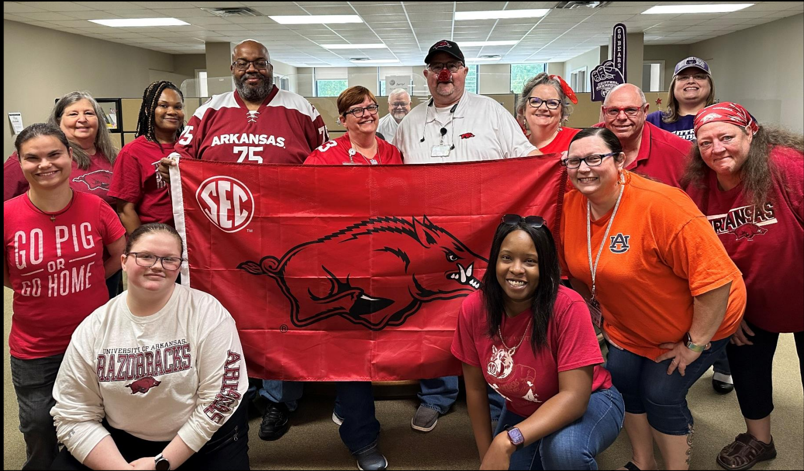
Little Rock Team