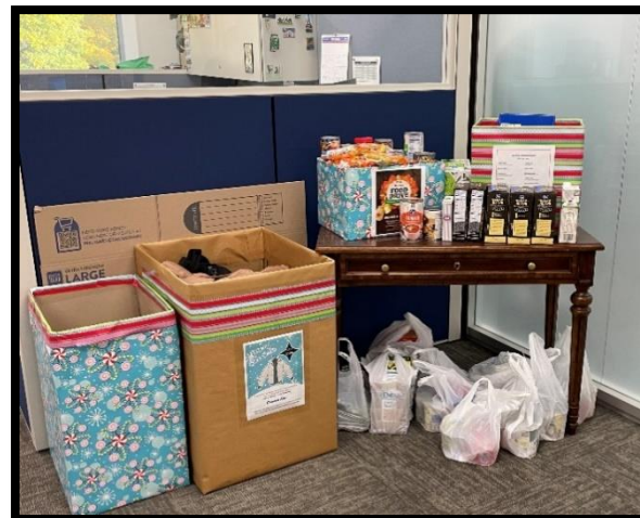
DFA Holiday Food Drive & Winter Coat Drive Station

Thank you to all who supported these DFA events. You are instrumental to both DFA’s daily commitment to the citizens of the state and for representing DFA in going above and beyond the call of your service.