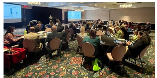
Arkansas Business Summit 2023