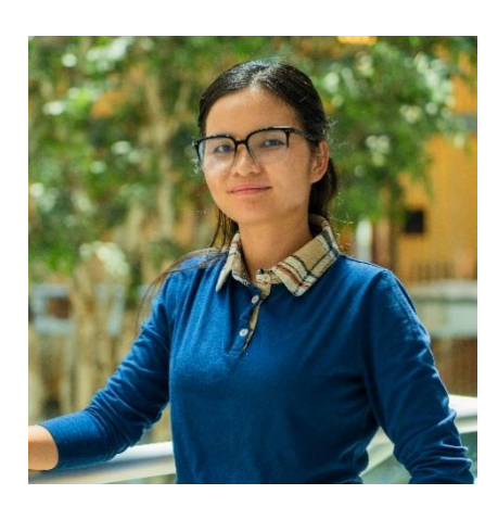
MI LAY Accounting